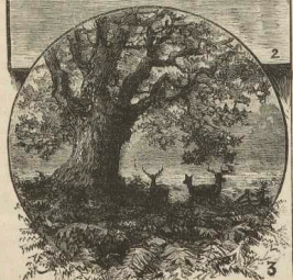
1. Monument to late Prince Imperial, and Camden House, Chislehurst. 2. Molesey Weir. 3. In Richmond Park.