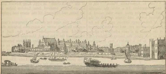
OLD HAMPTON COURT. (From an ancient Painting.)

"How soon a look may print a thought, That never may remove !"