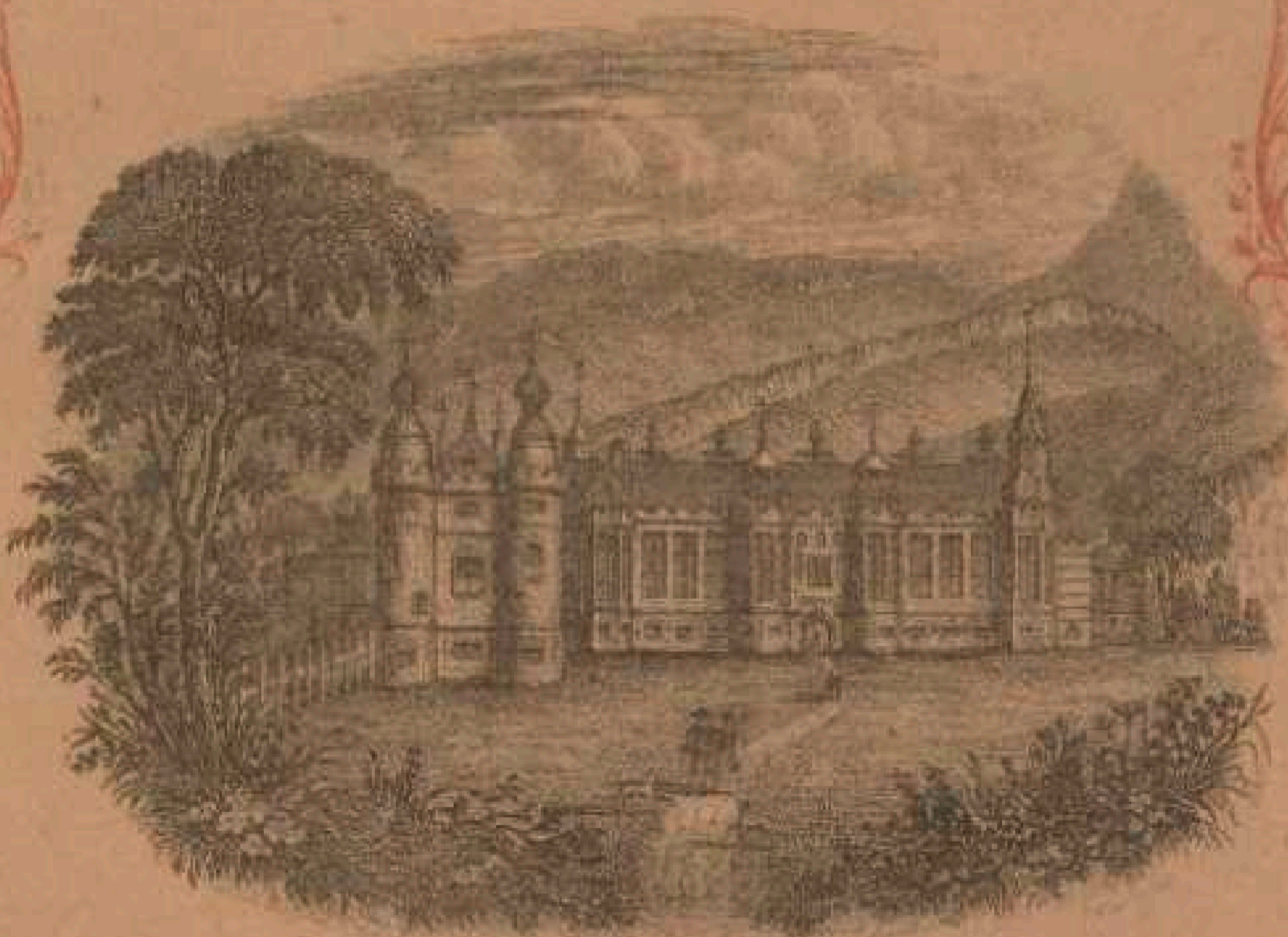
THE ROYAL PALACE OF HOLYROOD, NOVEMBER 1850