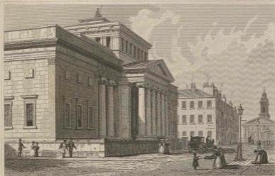
THE ROYAL INSTITUTION, MANCHESTER.